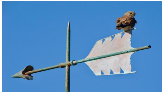
Above: It's not long before the wildlife start to make use of the wind vane.