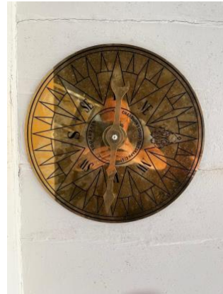
Left: The compass rose is now attached to the ceiling.